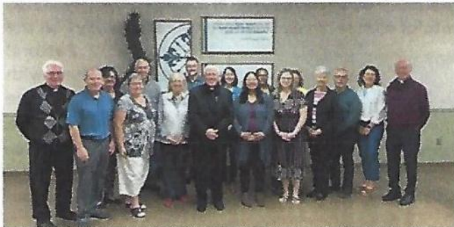
Diocesan Pastoral Council

A Deanery is a geographic area comprising Catholic parishes and institutions, overseen by a diocesan priest with the title Dean. Deans, who are elected by their brother priests and who constitute in large part the Presbyteral Council, play a crucial role in coordinating common pastoral activities (for example religious education, parish missions, youth ministry, penance services, and faith formation), fostering collaboration among parishes, and supporting fellow priests. Each Deanery has a lay representative on the Diocesan Pastoral Council, a body composed in large part of lay faithful from our parishes that advises me on pastoral concerns and provides feedback on ministerial initiatives. Through the Diocesan Presbyteral Council (priests) and the Diocesan Pastoral Council (laity), the consultative bodies with whom I meet regularly, I receive insights and feedback from Deanery parishes as I consult with representatives from around the diocese, engaging in fruitful conversations about the pastoral care of our people.